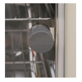
Inner Door Knob

Labwit quality assurance program demands the continuous assessment and improvement of all Labwit products. Information in this leaflet could thus change without notification and does not constitute a product specification. Please contact Labwit or their representatives if you require more details