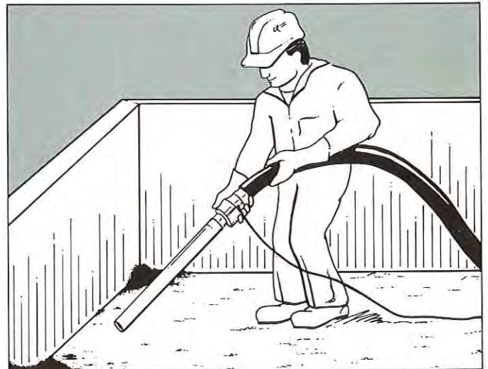
• Ideal for industrial clean-up applications.

We understand that it sometimes takes a non-standard product to solve a special problem. If you need a product for a special application, just let us know. We frequently customize our equipment or design new equipment to meet special needs. BLOVAC has a range of products beyond this literature, please ask your local distributor for assistance.