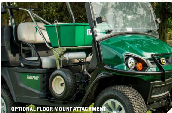
OPTIONAL FLOOR MOUNT ATTACHMENT