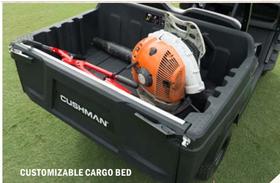
CUSTOMIZABLE CARGO BED