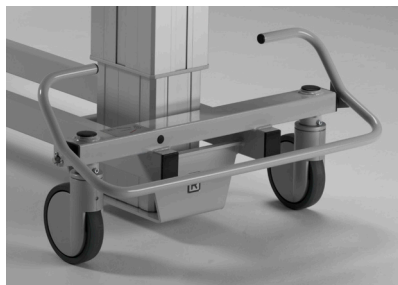
Convenient single foot control for straight steering and brakes.