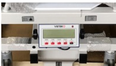
Scale is available as an option