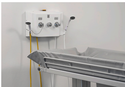
TR4200 with TR2810 Shower Panel