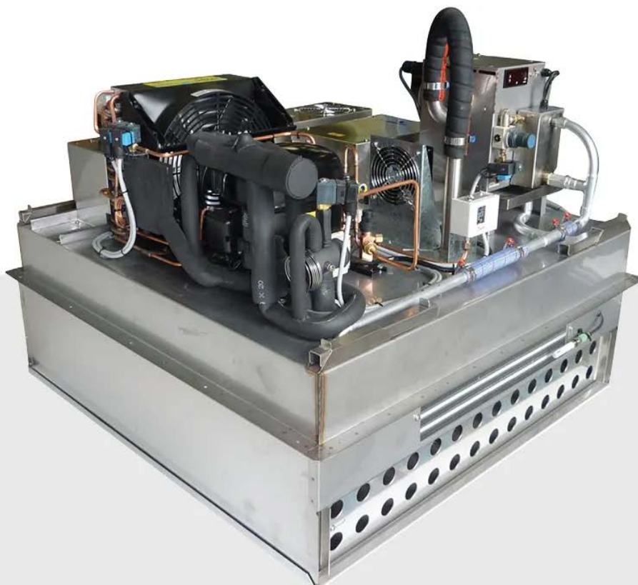
Unit seen outside the workspace