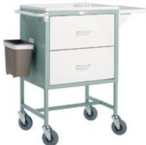
KH222WEB with options folding shelf and waste bin