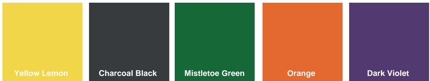
Non-Standard Powdercoat Colours (additional cost may apply)