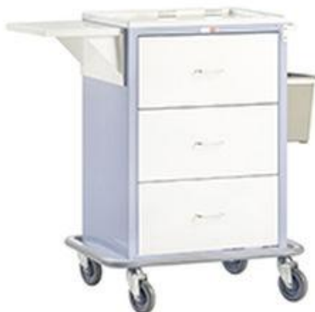
KH220WEB with options folding shelf and waste bin