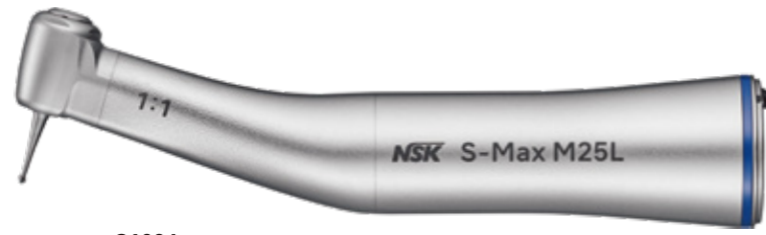
1:1 Direct Drive

OPTIC MODEL: M25L ORDER CODE: C1024 NON-OPTIC MODEL: M25 ORDER CODE: C1027