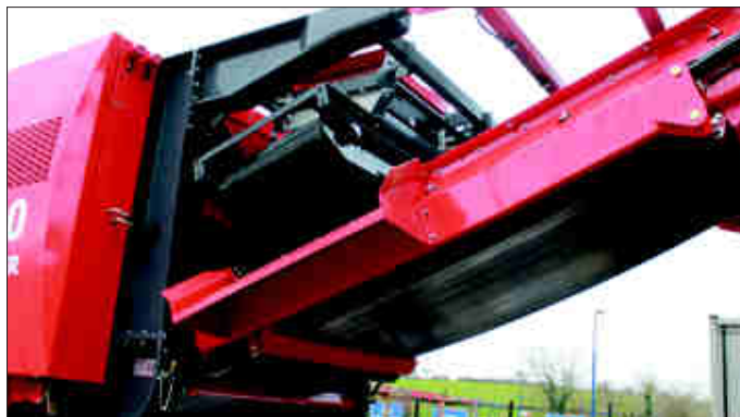
Magnetic Separator (Optional)