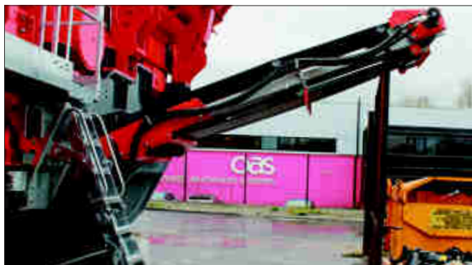
Bypass Conveyor (Optional)