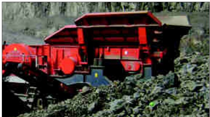
Hopper and Feeder