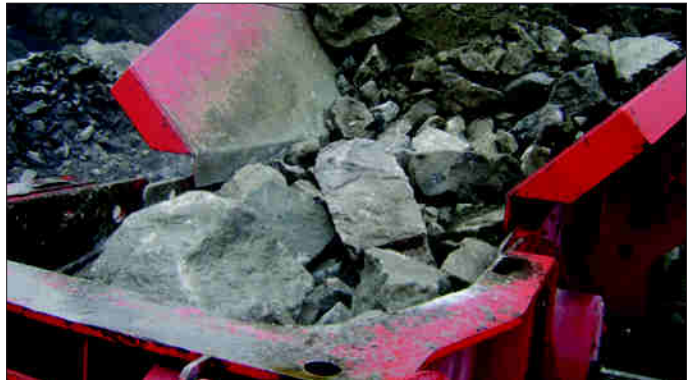
Hopper and Feeder