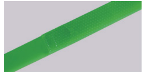
Friction Weld Sealing Technology