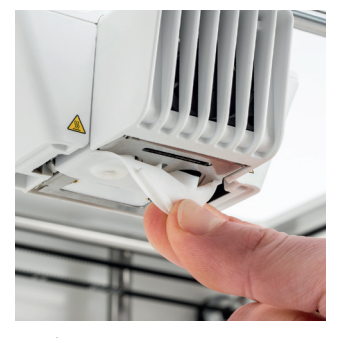
Nozzle covers x10 Replacement covers keep your print head in top condition