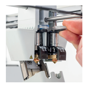
Print core BB 0.4, 0.8 mm Specially designed for printing soluble support material