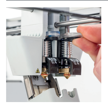
Print core AA 0.25, 0.4, 0.8 mm Quick-swap nozzles minimize downtime