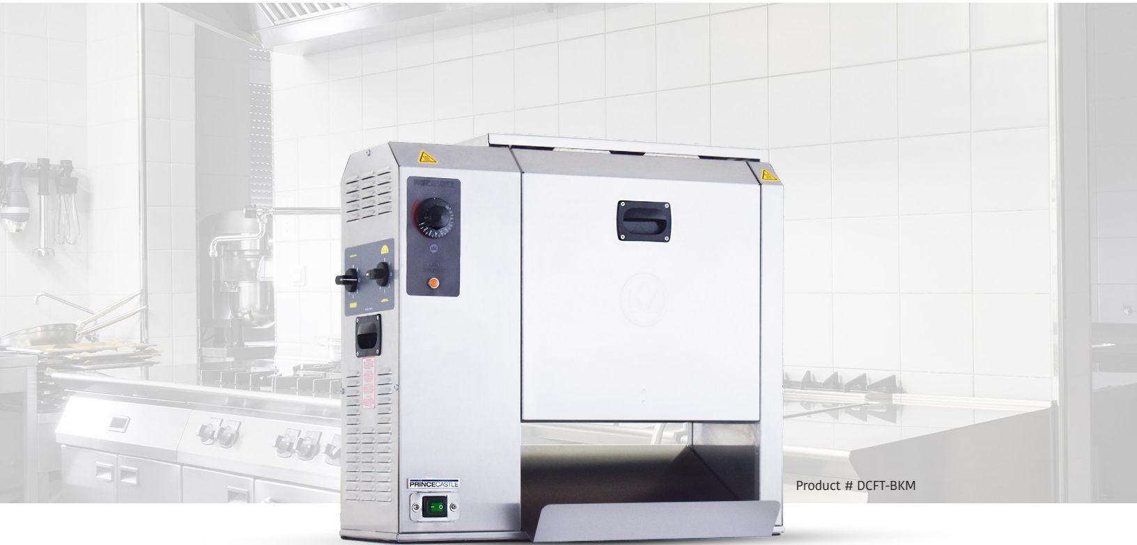
Product # DCFT-BKM