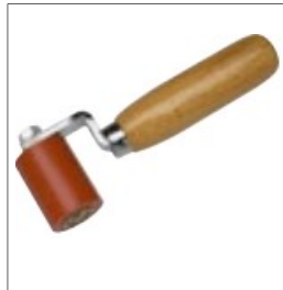
45mm Pressure Roller with 1 arm