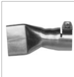
40mm Flat Nozzle