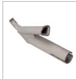
5.7mm Triangular Speed Welding Tip