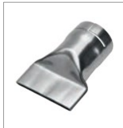
70 x 4mm Wide Slot Nozzle