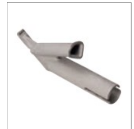
7mm Triangular Speed Welding Tip