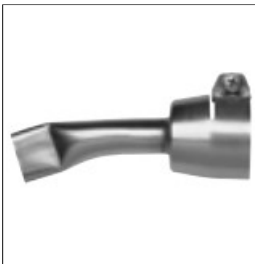
20mm Flat Nozzle