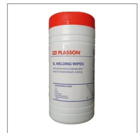
Isopropyl Alcohol Wipes