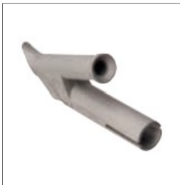
3mm Round Speed Welding Tip