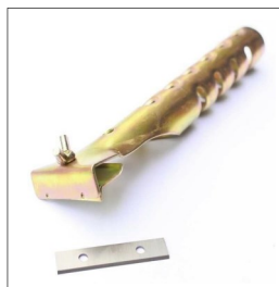
50mm Flat Double Edged Scraper (Replacement Blades Available)