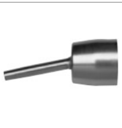
5mm Standard Nozzle

Essential accessories for all aspects of hot air welding.