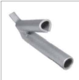
5mm Triangular Speed Welding Tip