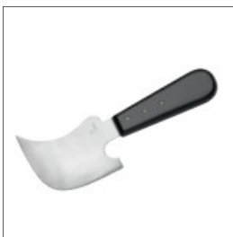
Quarter Moon Knife