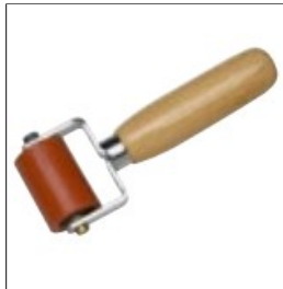
45mm Pressure Roller with 2 arms