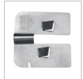
Weld Seam Slide