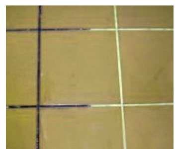
Tiles and Grout