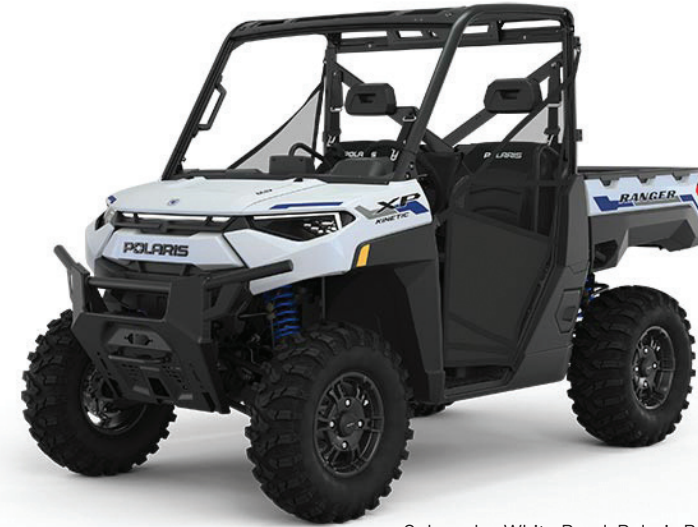
Colour: Icy White Pearl, Polaris Pursuit Camo

*Range estimates based on manufacturer data on typical customer driving usage and conditions. Actual range varies based on conditions such as external environment, weather, speed, cargo loads, rates of acceleration, vehicle maintenance, and vehicle usage.