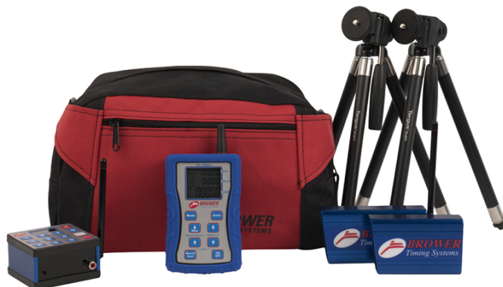
The TCi-Timing System package as shown includes 1 x TCi-Timer, TCi-PhotoGate A & B and 1 x TCi Motion Start in a carry bag.

The TCi-System is a wireless timing device that enables athletes and coaches to measure time, speed, count repetitions, input test data and save it all in the TCi-Timer memory. The TCi-System can send radio transmissions up to 300 metres and is accurate to the 0.001 second, making it a highly precise timing tool. It is also equipped with five different radio frequencies allowing multiple Brower systems to be used in the same area. With Brower Timing's dedication to portability, all components of the TCi-System have been designed to fit neatly into a small lumbar pack.