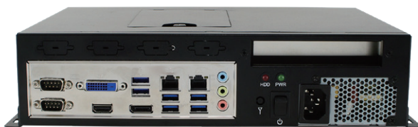
Rear I/O (Based on MI999 &amp; MI992VF-7820 &amp; MI991 &amp; MI990 I/O)