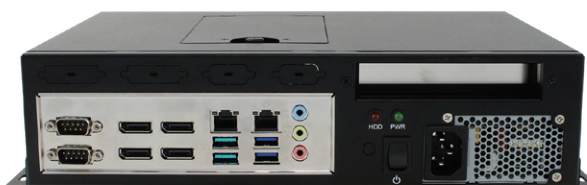
Rear I/O (Based on MI989 I/O)