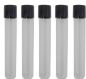
Glass test tubes 16mm BS-050102-MK

Glass Test Tubes 16x100mm, high borosilicate, PP Cap with silicone pad.