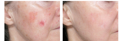
BEFORE ACTINIC KERATOSIS LESION COUNT: 22