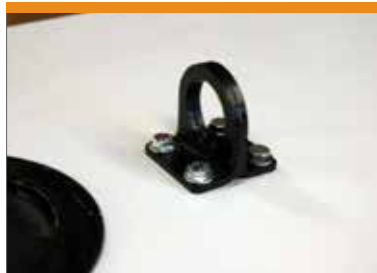
LIFTING HOOK GANCIO DI SOLLEVAMENTO