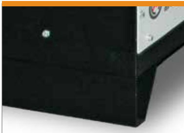
SELF SUPPORTING FRAME TELAIO AUTOPORTANTE