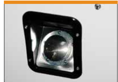
TANK REFILLING POINT BOCCHETTONE SERBATOIO