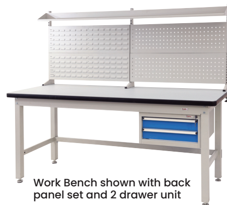
Work Bench shown with back panel set and 2 drawer unit