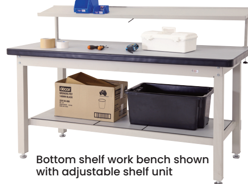
Bottom shelf work bench shown with adjustable shelf unit

Back panel kit is supplied with both louvre panel and metal pegboard and 2 shelves