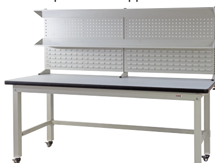
Work Bench shown with back panel and castor kit

Back panel kit is supplied with both louvre panel and metal pegboard and 2 shelves