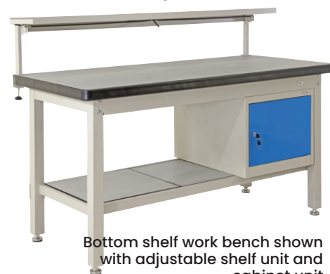
Bottom shelf work bench shown with adjustable shelf unit and cabinet unit