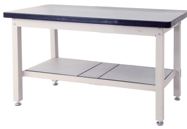
Work bench with bottom shelf (available in 1800mm and 2100mm long)