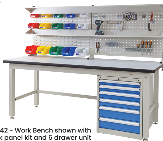
V7242 - Work Bench shown with back panel kit and 6 drawer unit