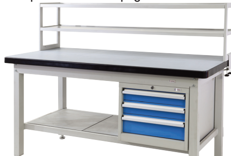
Bottom shelf work bench shown with 2 tier shelf and 3 drawer unit