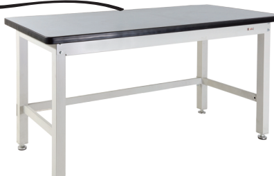
Work bench with no bottom shelf (available in 1800mm and 2100mm long)