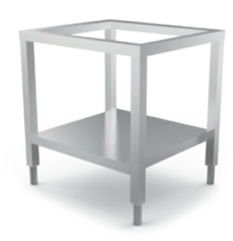
STAND Stand with bottom shelf, with adjustable feet.