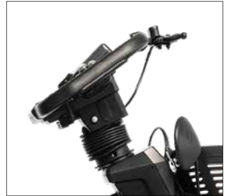
Supplemental Hand Brake