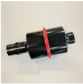
Detachable Exhaust Silencer (GL Series)