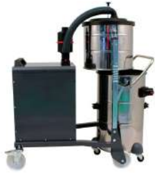
Side view of Detachable Tank (GL Series)