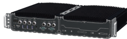
▲ SEMIL 19" rack-monuted