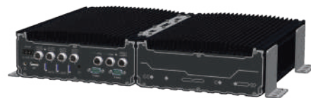
▲ SEMIL wall-mounted