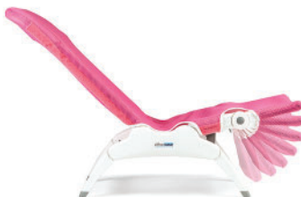
Highly adjustable Backrest angle, seat angle and calf rest angle adjust individually.