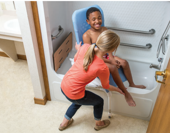
3. As the bath chair rotates, it continues to move back over the tub. Gently lift the client's legs to clear the edge of the tub.