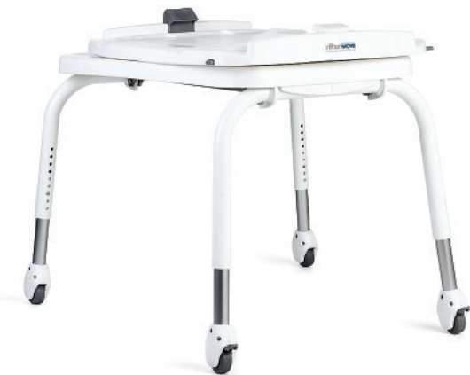
Tub transfer base