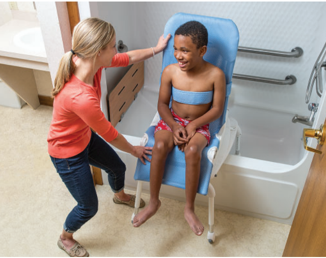
1. With the client secured in the chair, push the transfer base to the back of the tub as far as it will go and lock the wheels.