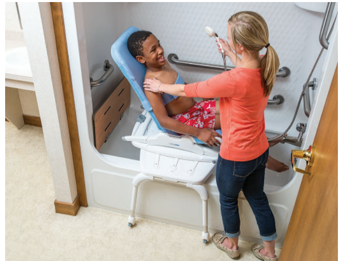
4. In the final position the bath chair is over the tub and can be adjusted as desired for showering.