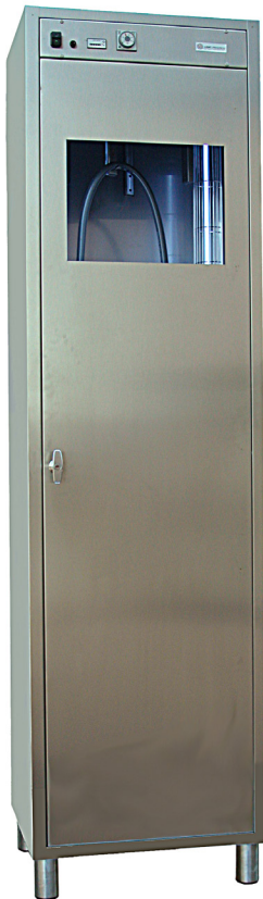
Floor standing model endoscopic probes rack

The UV-CABINET series includes several models of floor standing and wall unit cabinets, with one or two doors or provided with shelves (UV-CABINET-C) or provided with the specific support for endoscopic probes (UV-CABINET-E).