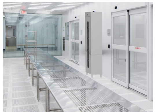
Application in pharmaceutical industry

UVGI technology is a physic disinfection method with a great cost/benefits ratio, it's ecological, and, unlike chemicals, it works against every microorganisms without creating any resistance.