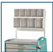
Tilt Bin Organiser