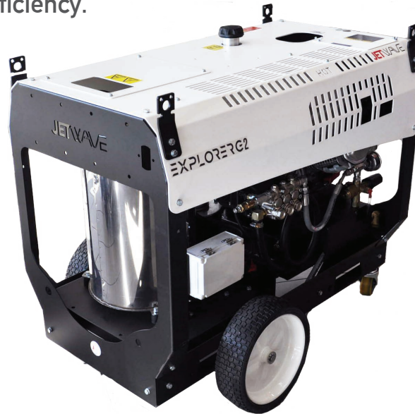
Part No.: TROLLEYKIT

The Jetwave® Explorer™ G2 heavy duty professional hot water petrol powered by HONDA™ pressure washer is revolutionary in its design and innovation. Australian engineered and assembled using only the best quality Italian and global components; it offers an industry first multi configurable modular kit to maximise space and efficiency.