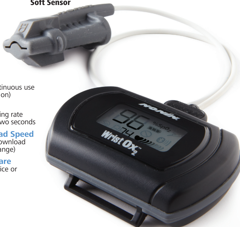
WristOx 2 ™ , Model 3150 Wrist-worn Pulse Oximeter