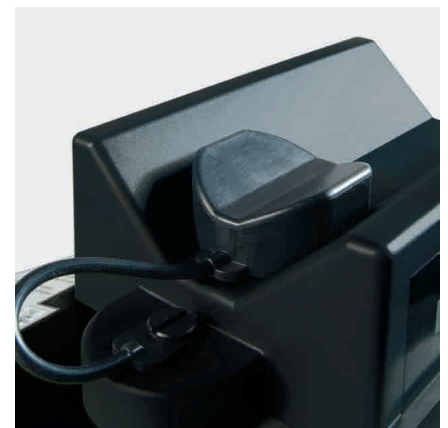
Adapter for different cylinder sizes

If you require oxygen for several hours of the day, cylinder C or cylinder D may be more suited to you. Cylinders C and D provide around 6 or 10 hours of oxygen, respectively (when in PulseDose mode), with filling times of 130 minutes and 215 minutes.