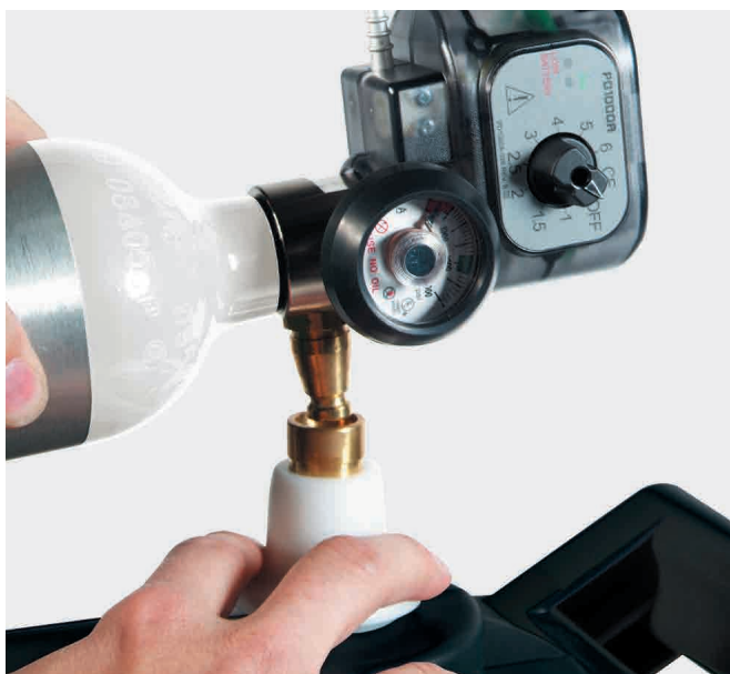
Easy to operate click-on/off system