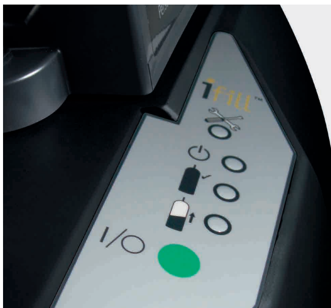
Simple push-button set up