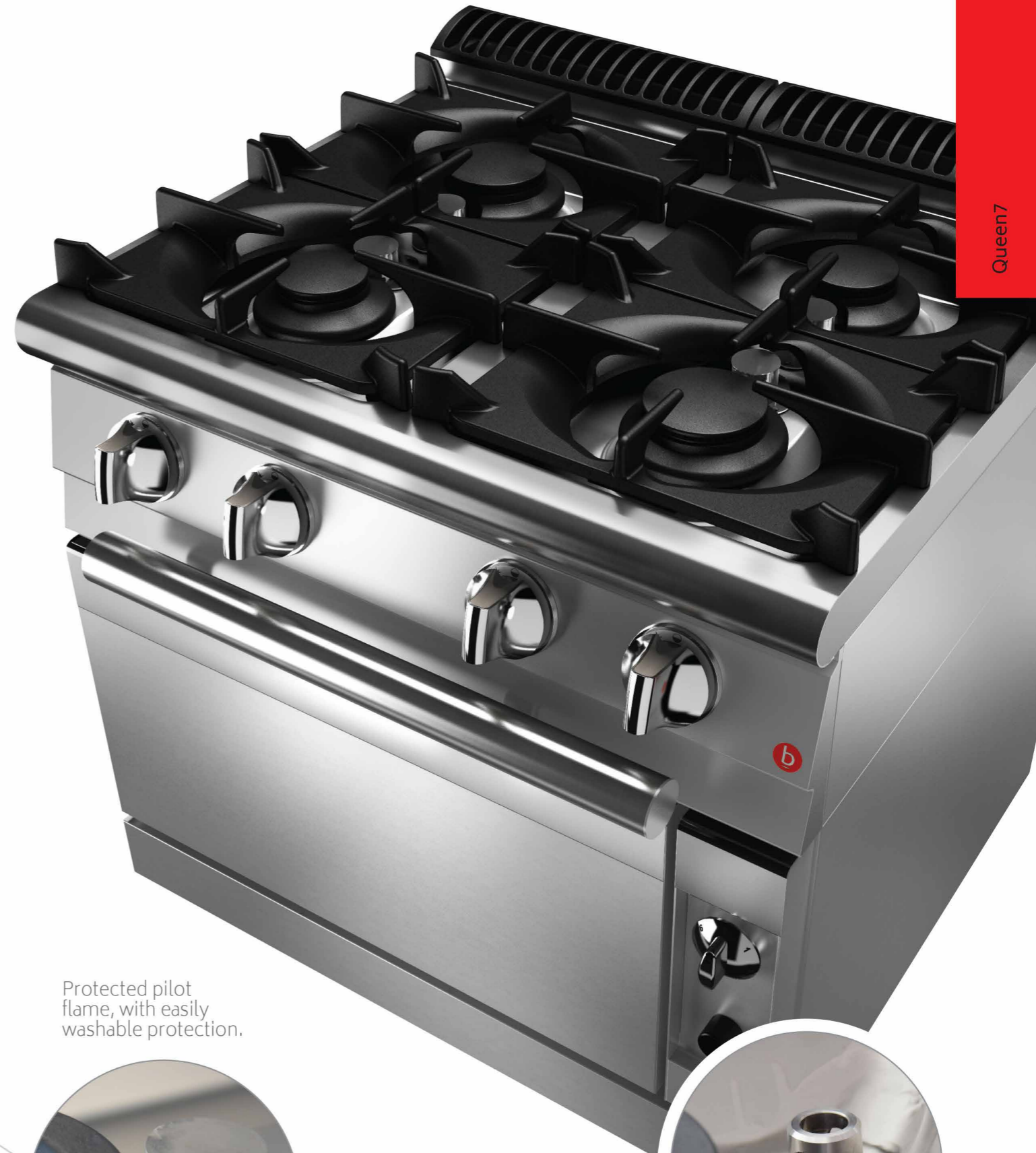
Protected pilot flame, with easily washable protection.