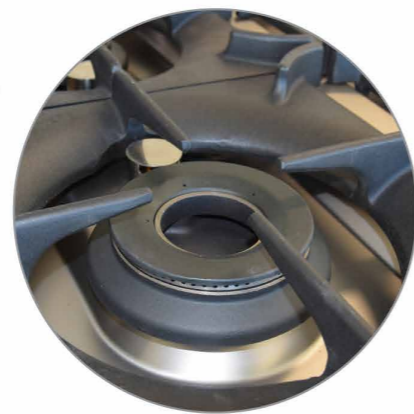
Long prongs enamelled cast iron grilles to easily move pots between one burner and another