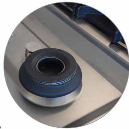
Fully moulded top, obtained from a large stainless steel plate