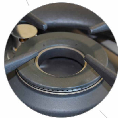
High power cast iron burners (3.5- 5.7- 7 kW)