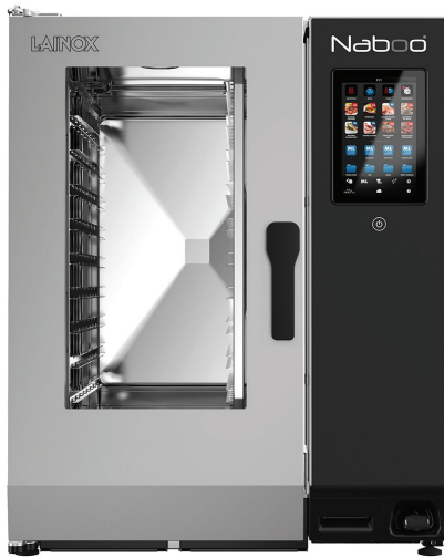
325 ↑ 530 1/1 GN

TOUCH SCREEN CONTROLS AUTOMATIC INTERACTIVE COOKING