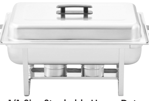
1/1 Size Stackable Heavy Duty Economy Chafing Dish 291611