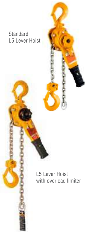
Standard L5 Lever Hoist