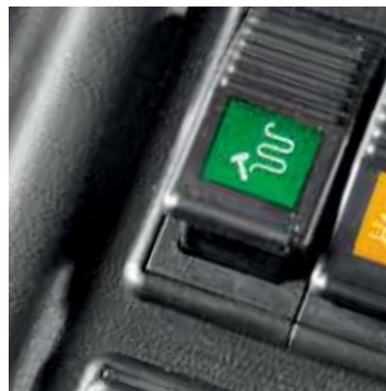
Button for activation of the filter shaking