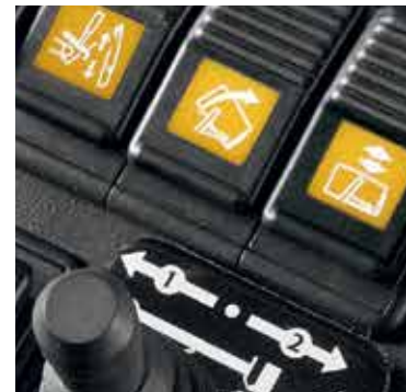
Hopper emptying buttons

The collection hopper is emptied by lifting it on vertical guides up to 180 cm.