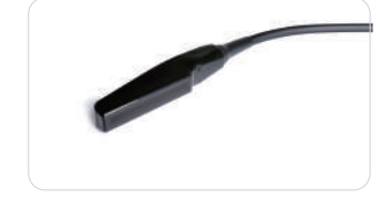
L761V Linear transrectal probe • 4-12 MHz • Reproduction • Large animals