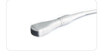
C322V Micro-convex probe • 2-7 MHz • Cardio • Abdominal