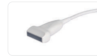
L741 Linear probe • 4-16 MHz • Small parts • High res. abdominal • MSK