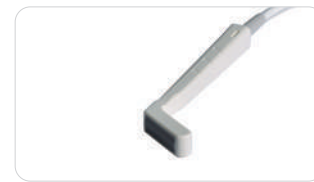
10I2 Intraoperative probe • 4-16 MHz • Ophthalmology • Superficial