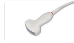
3C-A Convex probe • 1-7 MHz • Abdominal • Reproduction • MSK