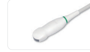
C613 Micro-convex probe • 4-13 MHz • Abdominal • Cardio • Ovum pick-up