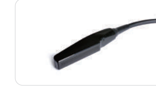
L741V Linear transrectal probe • 4-16 MHz • Reproduction • Large animals