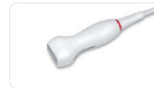
3P-A Phased array probe • 1-6 MHz • Cardio • Abdominal