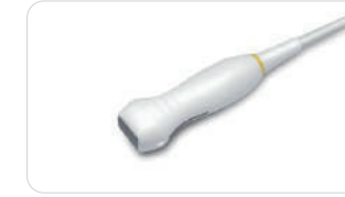
7P-B High frequency phased array probe • 2-9 MHz • Small animals • Cardio