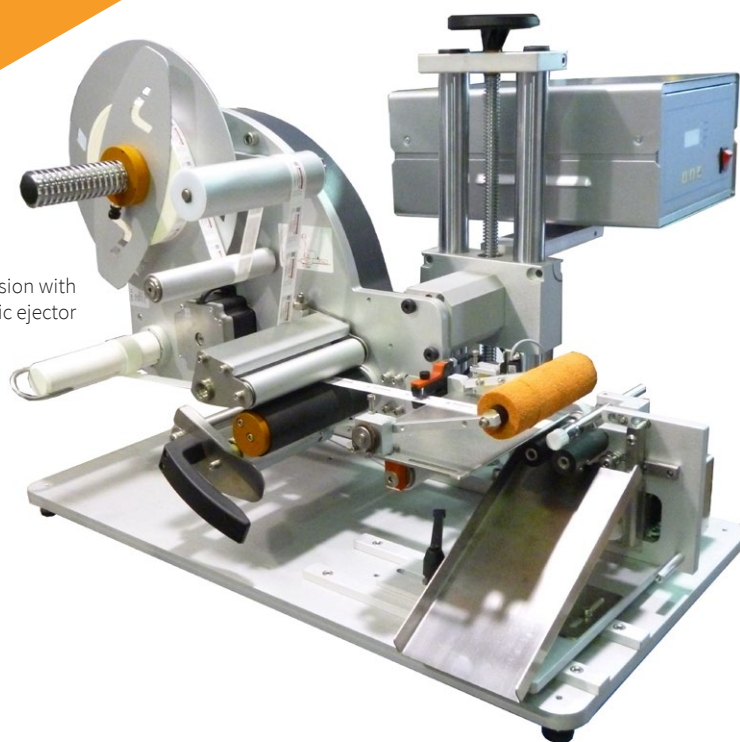
Version with automatic ejector

Mechanical unwinder Stop photocell Positioning device with motorized rolls Top table base support Micrometric adjustment unit Applicator roll with start sensor