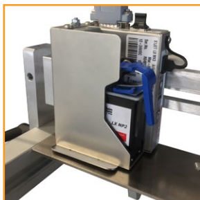
Ink-Jet coding units