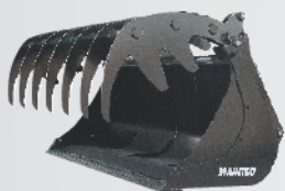
Multifunction grab bucket