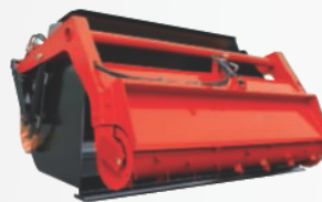
Silo unloader bucket