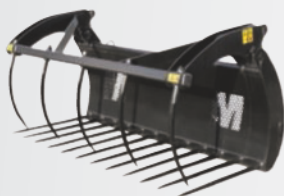
Large volume manure fork