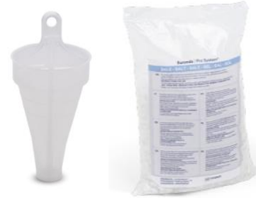
1 Kg salt and funnel