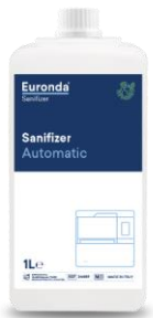
Sanifizer Automatic (1L)