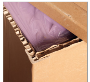
Heavy Duty Packaging