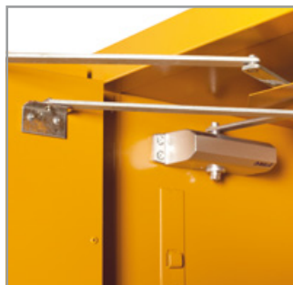
Sequential Self Closing Doors