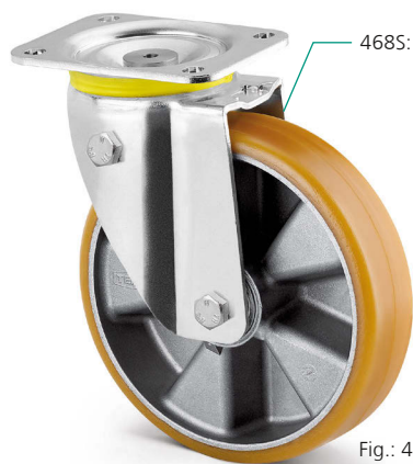
Fig.: 468S ITP 250 P63

You will find further technical datas on our website: www.tente.de