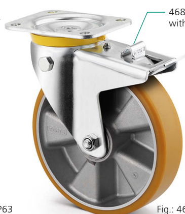
Fig.: 468B ITP 250 P63