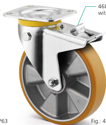
Fig.: 468B ITP 250 P63