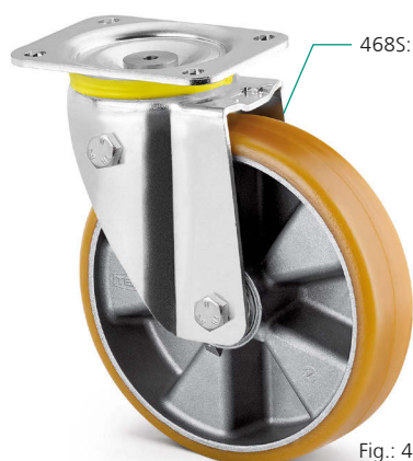
Fig.: 468S ITP 250 P63

Convenient – No matter what the direction of travel, the auto alignment returns the castor to its zero position when the pallet is raised, and so allowing space-saving storage. The pallet is then immediately ready to move the next time it is needed.