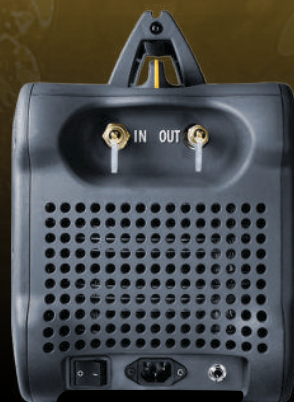
Easy access ports for one-handed operation