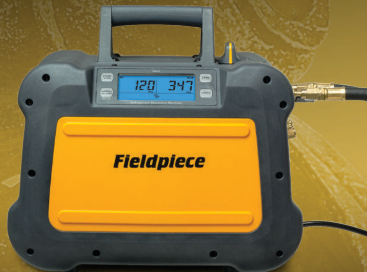
Bright digital display with status codes