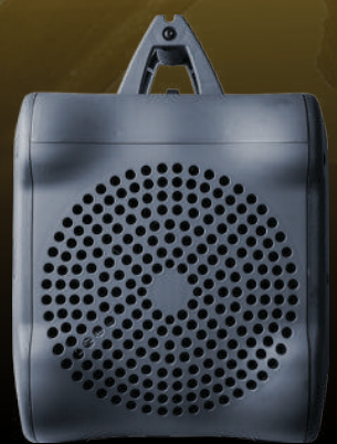
3,000 RPM for faster recovery