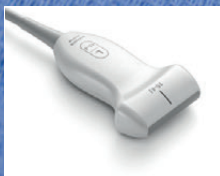
L15-4 ● 15-4 MHz Linear Scan Depth: 1.5–6 cm

Exam Types: Arterial, Breast, Carotid, Lung, Musculoskeletal, Nerve, Ophthalmic, PIV, Superficial, Venous