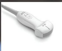
C10-3 ● 10-3 MHz Curved Scan Depth: 3–18 cm

Exam Types: Abdomen, Gynaecology, Lung, Nerve, Musculoskeletal, Early Obstetrics, Obstetrics, Spine