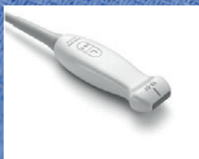
L19-5 ● ● 19-5 MHz Linear Scan Depth: 1–6 cm

Exam Types: Arterial, Breast, Carotid, Musculoskeletal, Nerve, Superficial, Venous