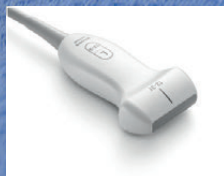
L12-3 ● 12-3 MHz Linear Scan Depth: 1.5–9 cm

Exam Types: Cardiac, Cardiac Resuscitation