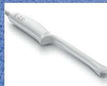
IC10-3 ● 10-3 MHz Curved Scan Depth: 3–15 cm

Exam Types: Arterial, Lung, Musculoskeletal, Nerve, Ophthalmic, PIV, Superficial, Venous