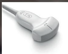
C5-1 ● 5-1 MHz Curved Scan Depth: 4.7–30 cm

Exam Types: Abdomen, Gynaecology, Lung, Nerve, Musculoskeletal, Early Obstetrics, Obstetrics, Spine