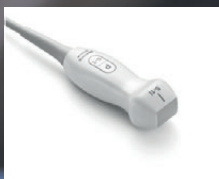
P5-1 5-1 MHz Phased Scan Depth: 5–35 cm

Exam Types: Abdomen, Gynaecology, Lung, Nerve, Musculoskeletal, Spine