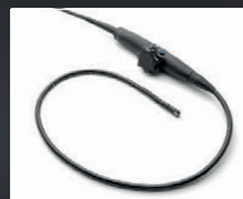
T8-3 8-3 MHz Multi Scan Depth: 4–18 cm

Exam Types: Abdomen, Cardiac, Focused Cardiac, Lung, Obstetrics, Orbital, Transcranial Doppler (TCD)