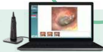
Viot™ Video otoscope