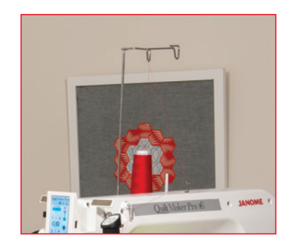
Built-in Thread Stand