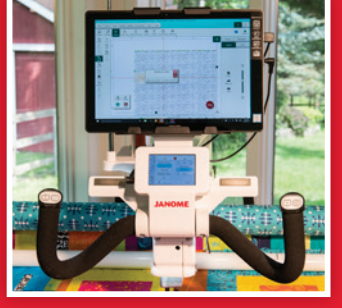
Pro-Stitcher pictured on QMP18

*Rear handlebars are an optional accessory