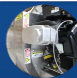
NO MAINTENANCE FAN