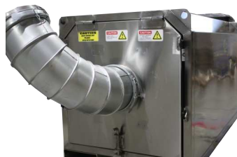
90-degree inlet elbow for boom