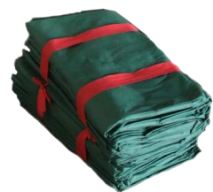
Additional 400litre bio degradable bags