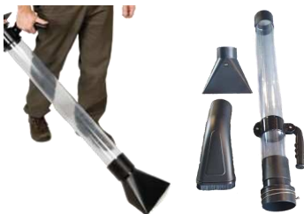
Insulation removal tool