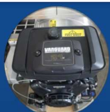
VANGUARD V TWIN 21HP ENGINE

As a rapid recovery machine it is perfect for fast and profitable ceiling insulation removal with the benefit of having a significantly longer working lifespan with minimal ongoing maintenance costs. Insulation Master comes complete including 30 metres of anti-static polyurethane vacuum duct hose. Available as either a skid mount or integrated into a custom road registrable trailer.