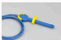
Rectal SpO2/TEMP sensors