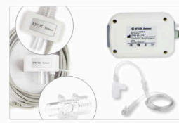
Sidestream / Mainstream ETCO2 Module