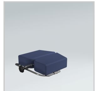
Folds for easy storage