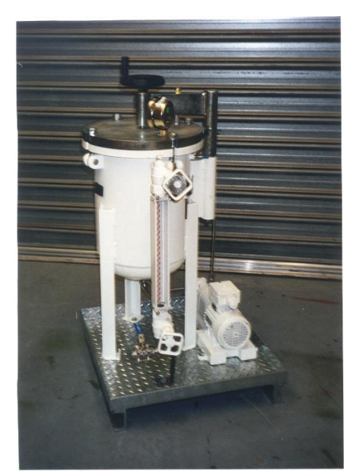
Fixed Collection Vessel