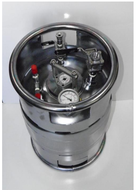
Portable Collection Vessel