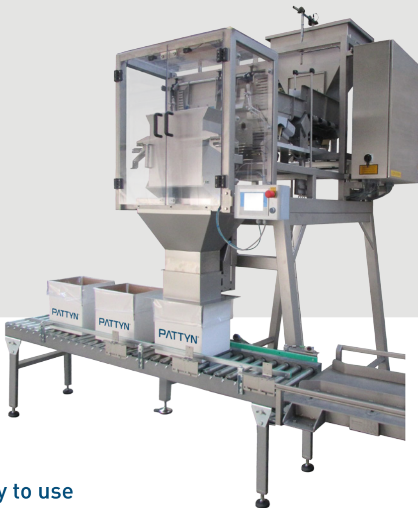
One head vibratory filler LVF-34A