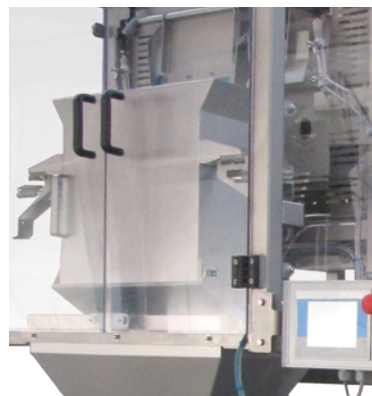
Filling in weigh hopper