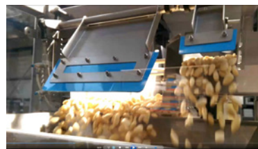
Coarse and fine filling